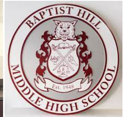
BHMHS BOBCAT STUDENT AMBASSADORS